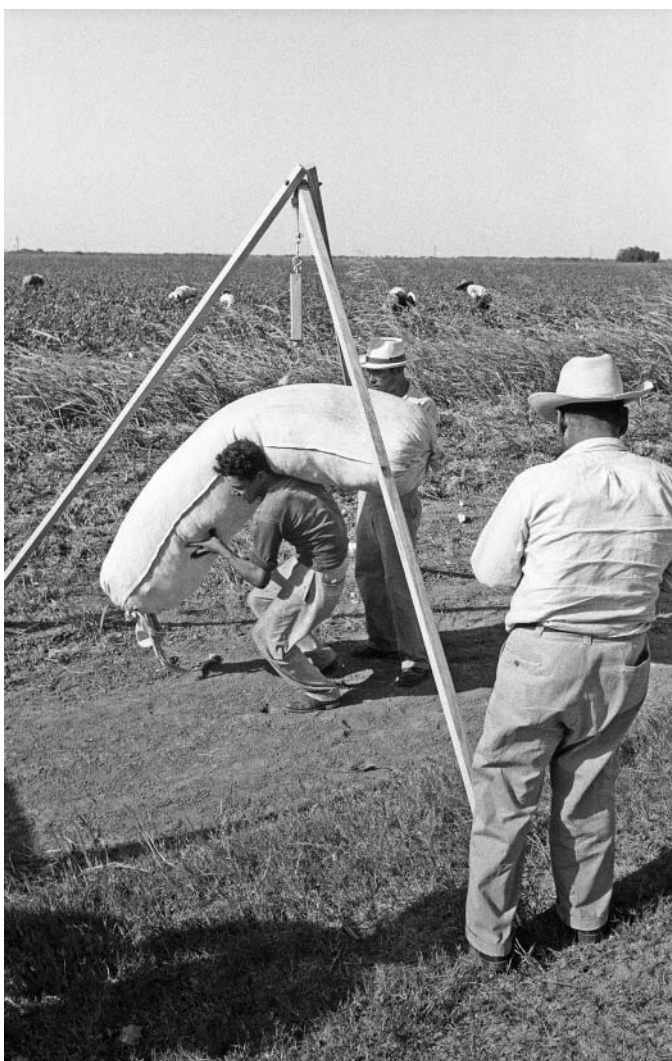
Figure 1. Resisting invisibility.

Jubilee and Pageant revealed unsanitized, arduous labor and its expropriation. Both magazines printed an image of a bracero collapsing under a bag of cotton. Two overseers monitor his work (fig. 1). 61 Leaning on Christian symbolism, the photograph dignifies the physical effort of the braceros. The migrant’s position reminds viewers of Christ carrying the cross, underscoring the bracero’s sacrifice as he labors for consumers “who know nothing” about his work. 62 Jubilee paired this image with a lengthy description of agricultural labor, scolding growers for paying braceros a paltry “50 cents a day.” 63